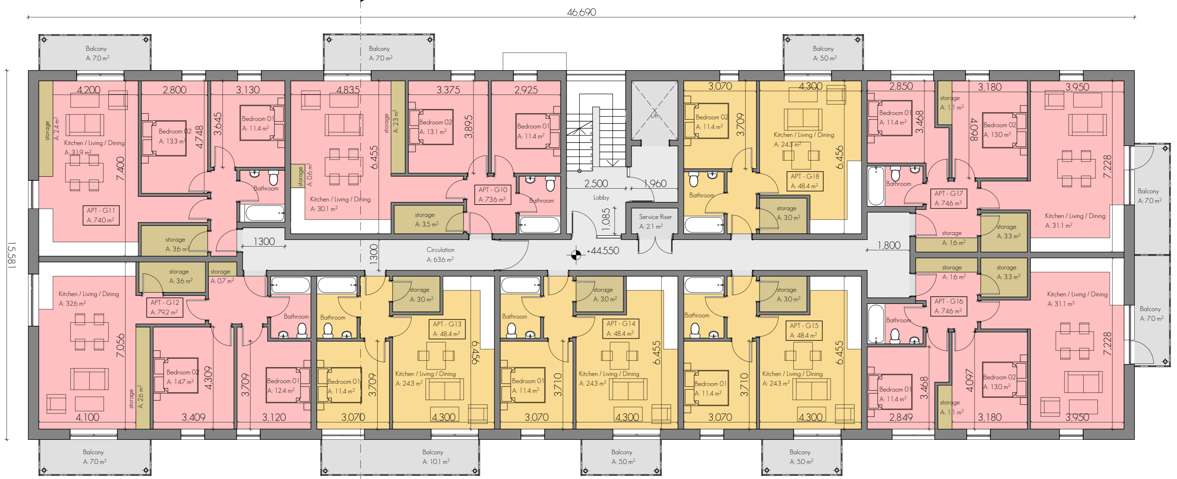
FIRST FLOOR PLAN - LEVEL_44.550 1:100